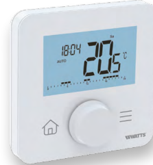
Programmable Wireless Heat & Cool