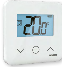
Digital Wireless Heat & Cool