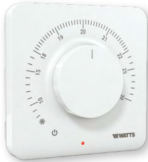
Analogic Wireless Heat & Cool