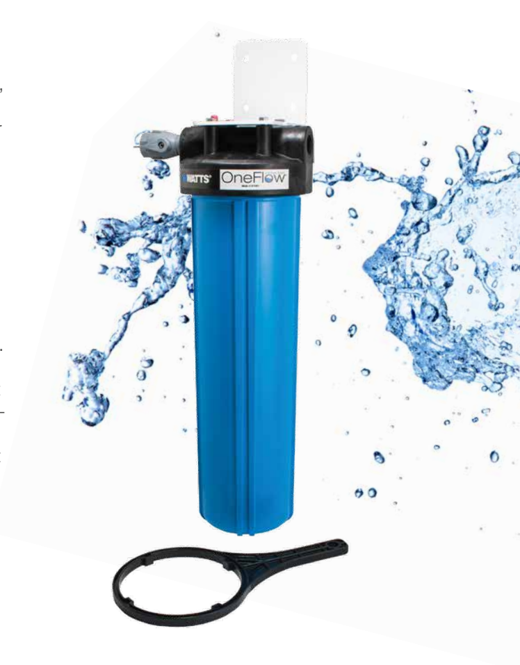
OneFlow® OFTWH-R model

In consultation with our customer service department , Marco Cerquozzi also suggested various improvements, by asking for brass shut-off valves to be included in the kit provided.